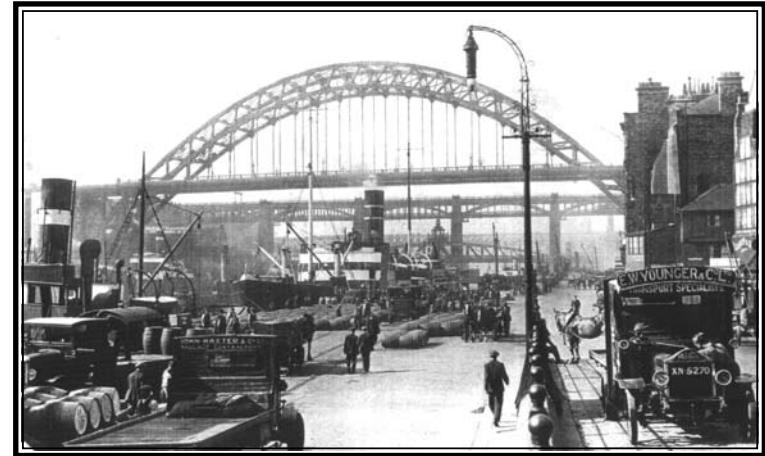
Newcastle Quayside 1928

Gateshead Health Centre Prince Consort Road Gateshead, Tyne & Wear NE8 1NB